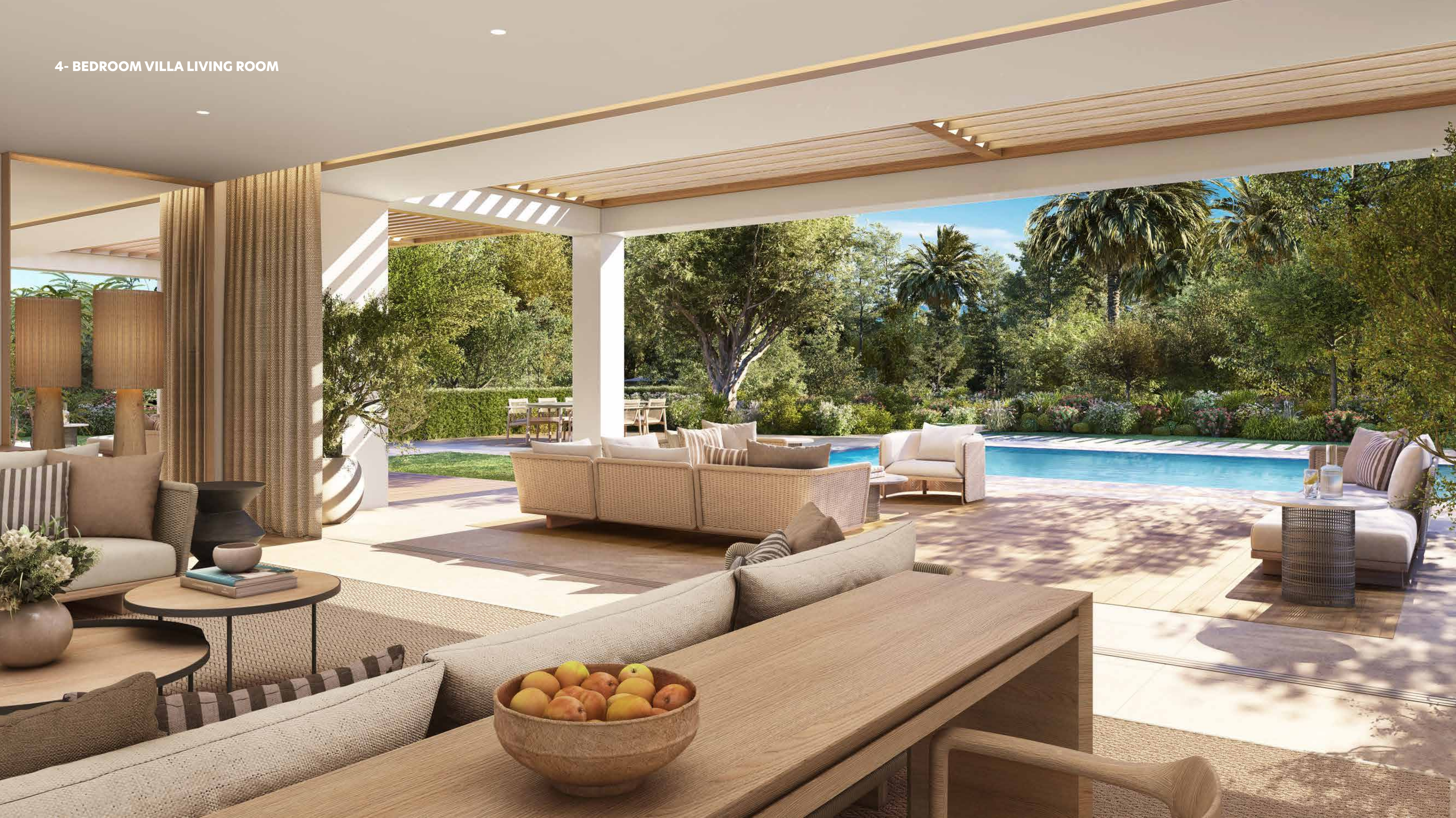
4- BEDROOM VILLA LIVING ROOM